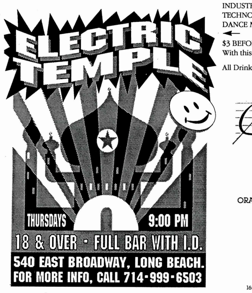
ALTERNATIVE INDUSTRIAL TECHNO-ACID-BEAT DANCE MUSIC $3 BEFORE 11PM if 21+ With this Invitation All Drinks $1 til 10:30